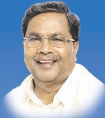
Sri Siddaramaiah Hon'ble Chief Minister