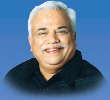
Sri R.V. Deshpande Minister for Large & Medium Industries and Infrastructure Development